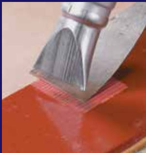
paint stripping • plus