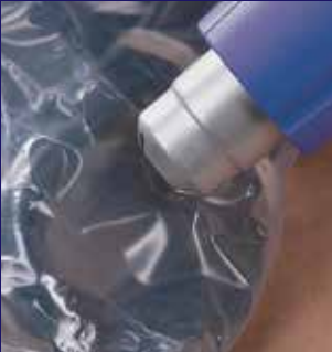
shrinking • pic • pro • plus