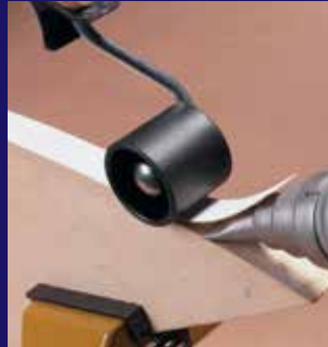
edge banding • plus