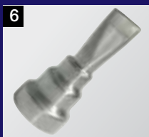
Overlap welding nozzle