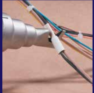
shrinking of tubes • plus