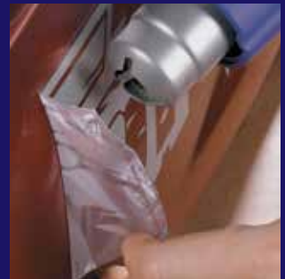
remove of stickers and films • pic • pro • plus