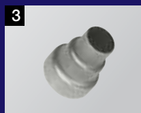
Reducer nozzle Ø 20 mm