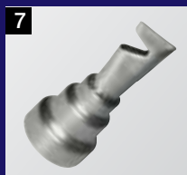
Solder sleeve reflector