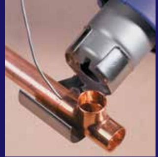
soldering of copper tubes • pro • plus