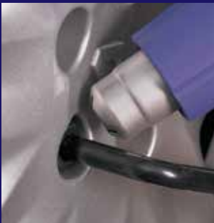
loosening of screws • pic • pro • plus