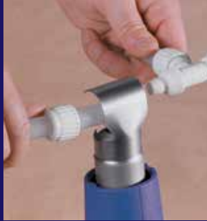
forming • pic • pro • plus