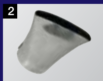
Wide slot nozzle