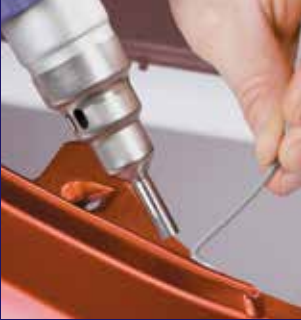
pendulum welding • pic